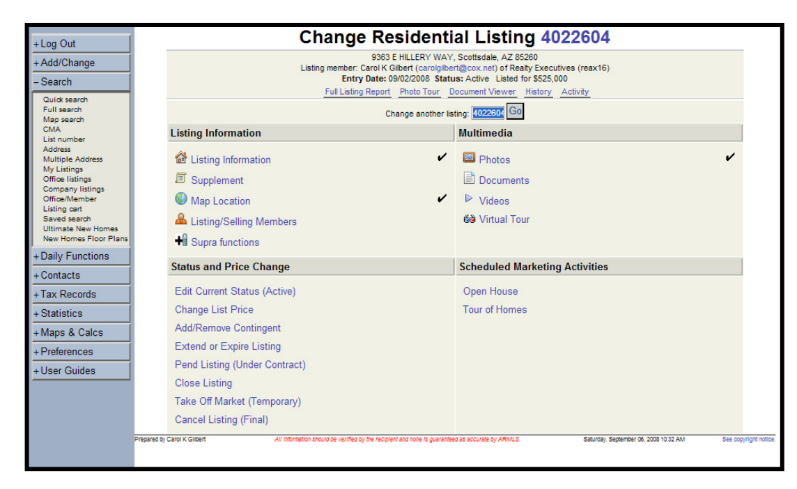
Step 3 For a Virtual Tour link copy and paste the <u>entire link</u> to this open space called Link & Save